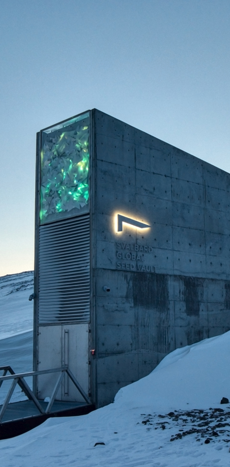
Svalbard Global Seed Vault