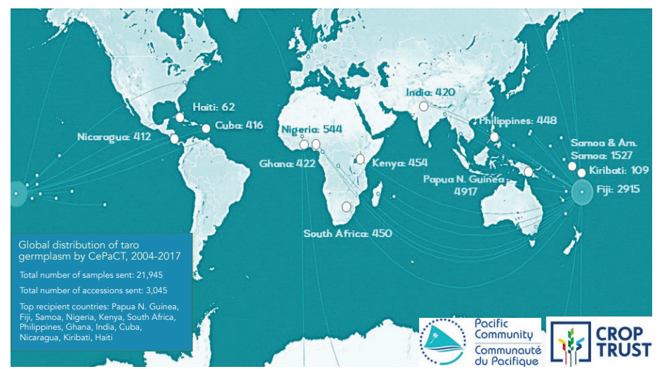
Figure 2. Global distribution of taro plant samples by the CePaCT.

successful and palatable hybrids that arose from the global rebreeding effort. His first seven cycles are illustrated in and currently in 2019 he is on Cycle 9. In 2009, 13 years after he began his ethnobotanical sojourn, his lines (Samoa 1-5) were made widely available to the export market, and household production is now almost back to pre-blight era levels.