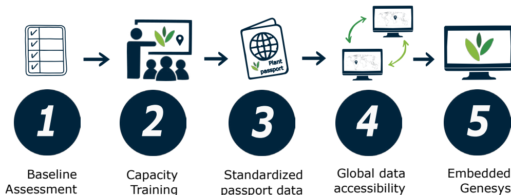
Figure 1. Genesys team collaborated with BOLD partners through a five-step process. Figure credit: Yue Yu

The next phase also focuses on supporting each genebank in embedding the Genesys interface within their institutional websites and to enable autonomous and regular data updates.