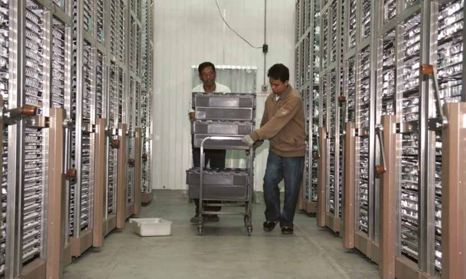
The genebank at the International Rice Research Institute in the Philippines. ▲