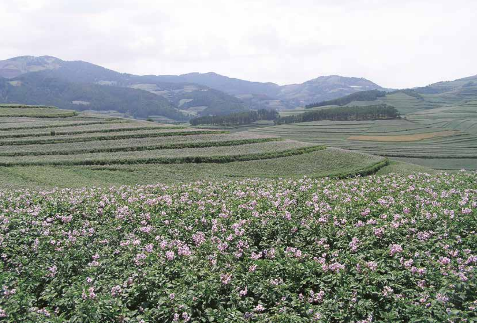
C88 potato variety growing in Yunnan, China. ▲